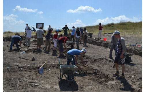
The 2011 excavation team at work on the acropolis of Bylazora.

Coming in January 2012: TFAHR will post information and applications for the 2012 excavation season at Bylazora.