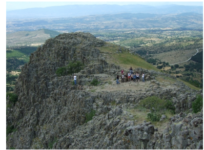
International Field School trip to Kokino.