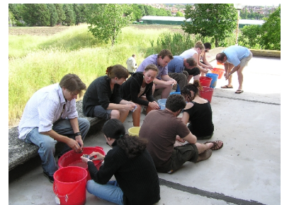
Daily pottery washing.