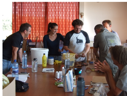
A pottery restoration workshop for the TFAHR International Field School.

The TFAHR International Field School is a collaborative venture in which participants from many walks of life are encouraged to share knowledge and experience with one another. Veterans from our earlier digs serve as trench supervisors and are given the responsibility to train new members. Team members have given presentations on other projects on which they have worked, and conducted workshops in pottery analysis, field documentation, pottery drawing, and site measurement and drawing. TFAHR International Field School members also have contributed articles to the TFAHR annual reports on the excavation work. We make it possible for students and teachers to further their careers by publishing the results of TFAHR's work in professional journals, or using it for term papers or advanced degrees. Many receive college credit from their own universities for the work on our digs.